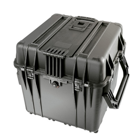
0340NF No Foam