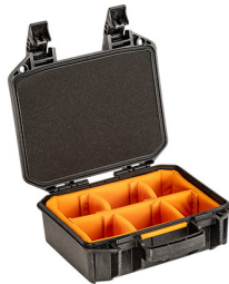
V100WD With Padded Dividers