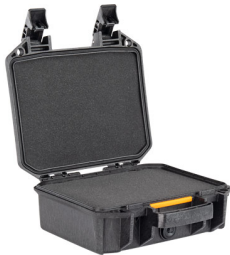
V100WF With Foam