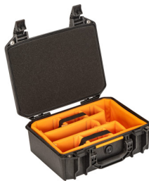
V200WD With Padded Dividers