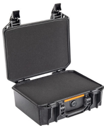
V200WF With Foam