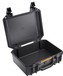
V200NF No Foam