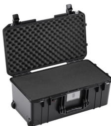
1556WF With Foam