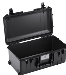
1556NF No Foam