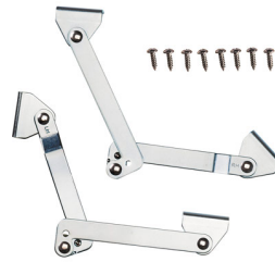
KIT-LIDSTAY-CARGO Cargo Lid Stays

23215 Early Ave • Torrance, CA 90505 USA • Phone: (310) 326-4700 • (800) 473-5422 • Fax: (310) 326-3311 sales@pelican.com • www.pelican.com