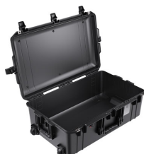
1595NF No Foam