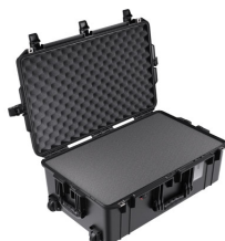
1595WF With Foam