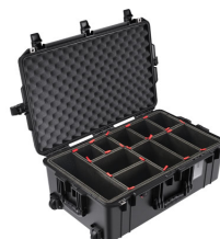
1595TP With TrekPak Divider System