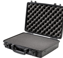
1470WF With Foam