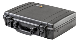
1470NF No Foam