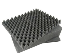
1471 3 pc. Replacement Foam Set