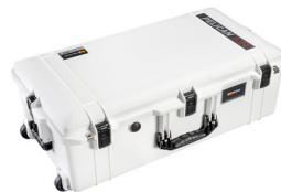
1615WWF With Foam