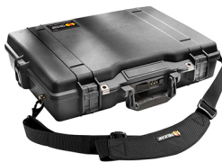
1495NF No Foam