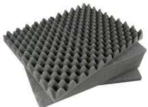
1481 3 pc. Replacement Foam Set