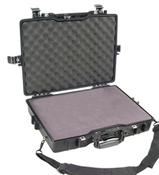
1495WF With Foam