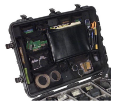
1669 Photo/Lid Organizer