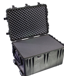
1660WF With Foam