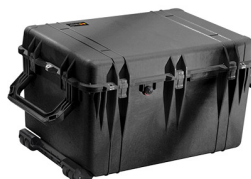
1660NF No Foam