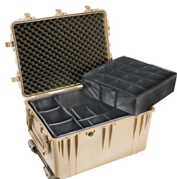
1664 With Padded Dividers