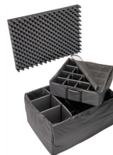
1665 Padded Divider Set