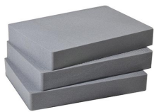
1662 Pick N Pluck™ Sections Only (set of 3)