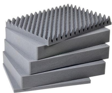
1661 5 pc. Replacement Foam Set