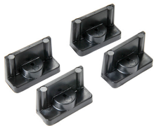
1507 Quick Mounts - set of 4