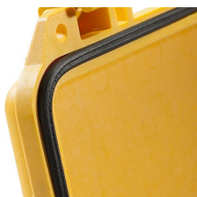
1773 Replacement O-ring