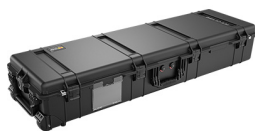
1770NF No Foam