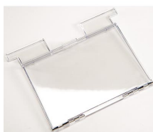
1630DC Document Container Accessory