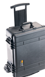
1560MWF With Foam