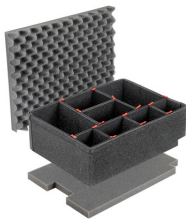
1560TPKIT TrekPak Case Divider Kit