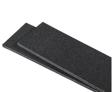
1560TPDIV Extra TrekPak Dividers