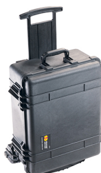
1560MNF No Foam