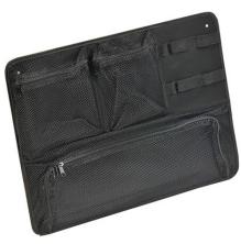
1569 Lid Organizer