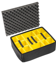
1565 Padded Divider Set