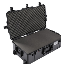
1615WF With Foam