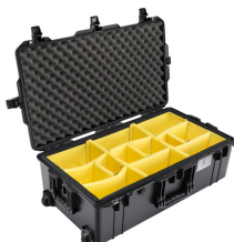
1615WD With Padded Dividers