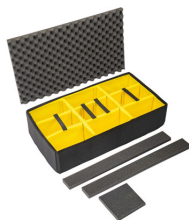
1615AirDS Padded Divider Set