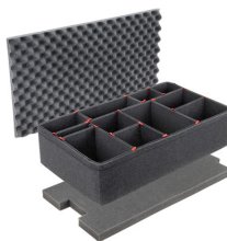
1615TPKIT TrekPak Case Divider Kit