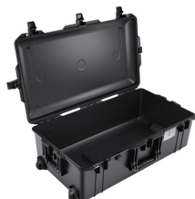
1615NF No Foam