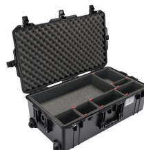
1615TP With TrekPak Divider System