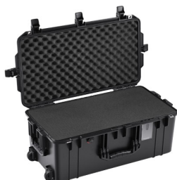
1606WF With Foam