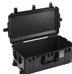
1606NF No Foam