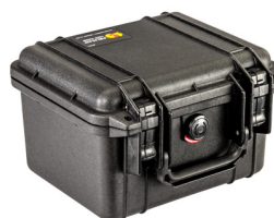
1300NF No Foam