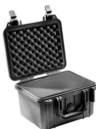
1300WF With Foam