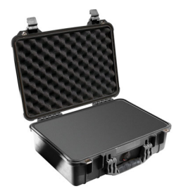
1500WF With Foam