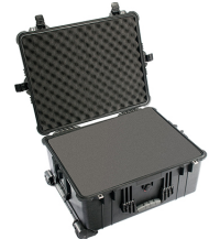
1610WF With Foam