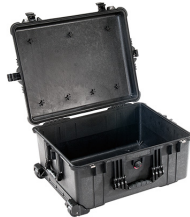
1610NF No Foam