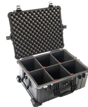
1610TP With TrekPak Divider System