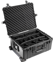
1614 With Padded Dividers