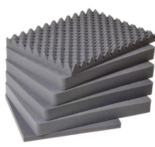
1621 6 pc. Replacement Foam Set