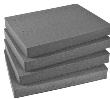
1622 Pick N Pluck™ Sections Only (set of 4)