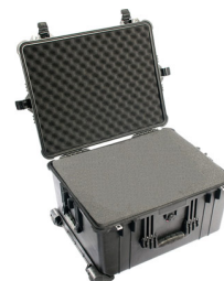
1620WF With Foam