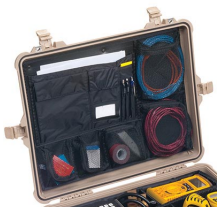
1609 Lid Organizer