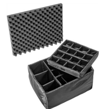
1625 Padded Divider Set