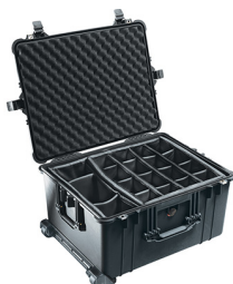
1624 With Padded Dividers