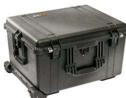
1620NF No Foam