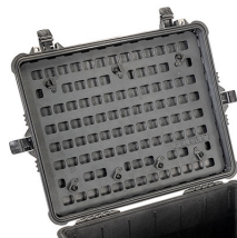
1610MP EZ-Click™ MOLLE Panel