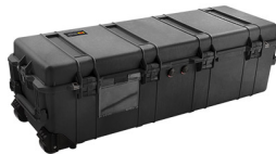
1740NF No Foam