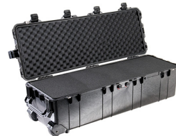
1740WF With Foam