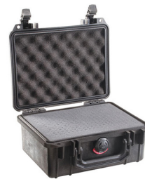
1150WF With Foam