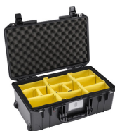
1535WD With Padded Dividers