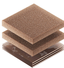
1500CI Corrosion Intercept Kit