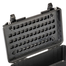
1535MP EZ-Click™ MOLLE Panel