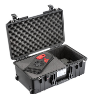
1535AIRTPF TrekPak / Foam Hybrid