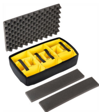
1535AirDS Padded Divider Set