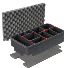
1535TPKIT TrekPak Case Divider Kit