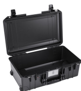
1535NF No Foam