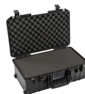
1535WF With Foam