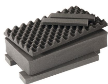
1535AirFS 3 pc. Replacement Foam Set