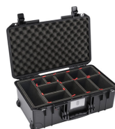
1535TP With TrekPak Divider System