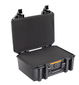
V300WF With Foam