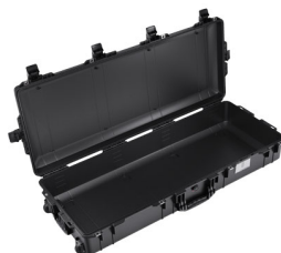
1745NF No Foam