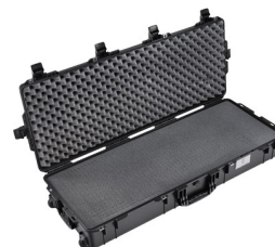
1745WF With Foam