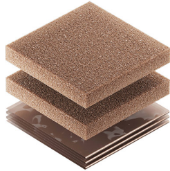
1500CI Corrosion Intercept Kit