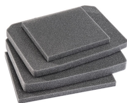
V100FS 4 pc. Replacement Foam Set