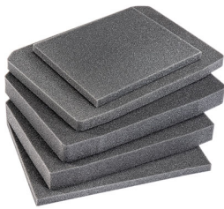
V200FS 4 pc. Replacement Foam Set