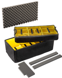
1626AirDS Padded Divider Set