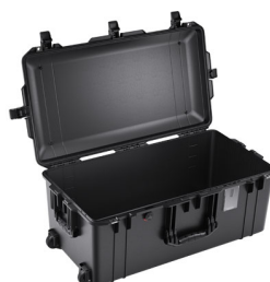
1626NF No Foam