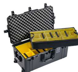
1626WD With Padded Dividers