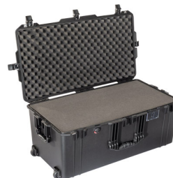
1646WF With Foam