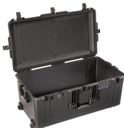
1646NF No Foam