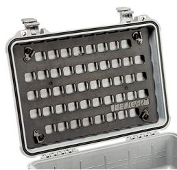
1500MP EZ-Click™ MOLLE Panel