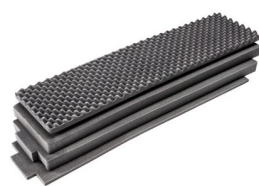
1755AirFS 4 pc. Replacement Foam Set