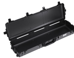
1755NF No Foam