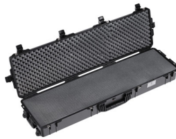
1755WF With Foam