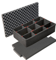
1595TPKIT TrekPak Case Divider Kit