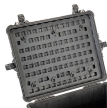
1610MP EZ-Click™ MOLLE Panel