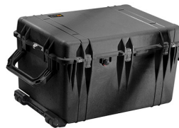
1660NF No Foam