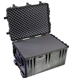
1660WF With Foam