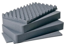
1511 4 pc. Replacement Foam Set