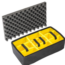
1515 Padded Divider Set