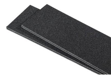
1510TPDIV Extra TrekPak Dividers

23215 Early Ave • Torrance, CA 90505 USA • Phone: (310) 326-4700 • (800) 473-5422 • Fax: (310) 326-3311 sales@pelican.com • www.pelican.com