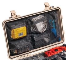
1519 Lid Organizer