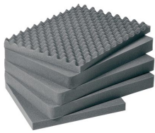
1611 5 pc. Replacement Foam Set