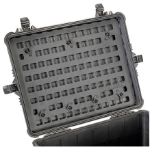
1610MP EZ-Click™ MOLLE Panel