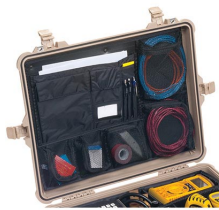
1609 Lid Organizer