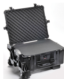
1610MWF With Foam