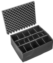
1615 Padded Divider Set