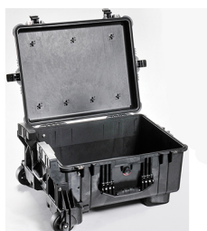
1610MNF No Foam