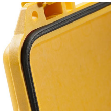
1623 Replacement O-ring