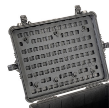
1610MP EZ-Click™ MOLLE Panel