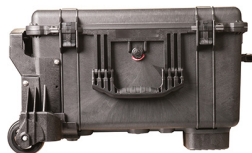
1620MNF No Foam