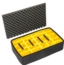
1675 Padded Divider Set