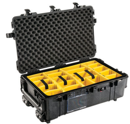
1674 With Padded Dividers