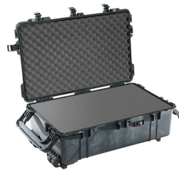
1670WF With Foam