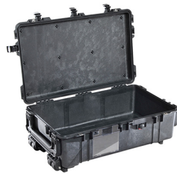
1670NF No Foam